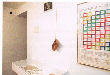
The Artist's Institute, installation view, New York